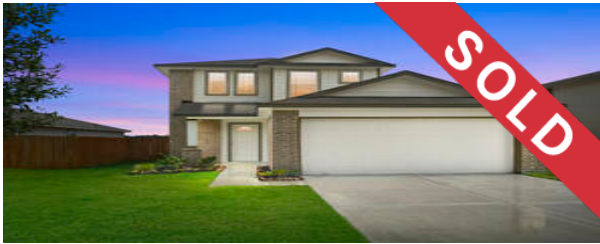
25638 Roy Rogers Road Splendora, TX 77372

1,788 Sq Ft • 3 Beds • 2.5 Baths Durango Floor Plan